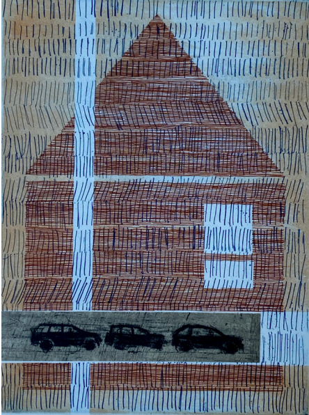
Three Cars Etching with Collage 2022

ON VIEW SATURDAY NOVEMBER 19 TH – SUNDAY DECEMBER 11 TH 2022